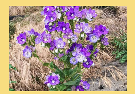
Life Finds a Way