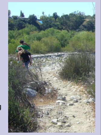
Hikers enjoying the use of an established trail in Big T.

If you have any questions about the established trails system, please contact LACDPW (contact information is on page 6).