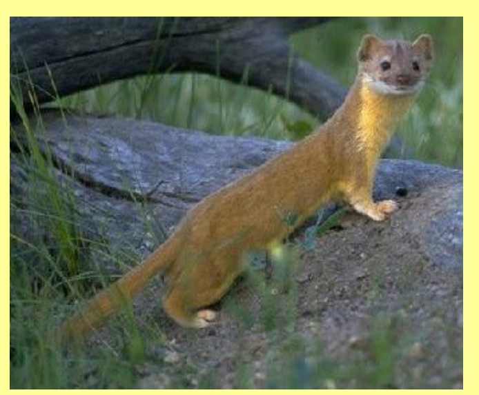
A long-tailed weasel looks around curiously. David Dahms.

Because its legs are so short and its body is so long, long-tailed weasels often use a bounding gate to get around. Bounding is fun to watch because weasels scrunch up their bodies like a caterpillar and hop from their back feet to their front feet and back again. They prey mostly on small mammals and help maintain rodent and rabbit populations. They live in woodlands and thickets as well as open areas, as long as they have access to a water source such as a stream. Long-tailed weasels are known to be noisy and will often call at other animals (even humans) that enter into their territory. However, they are also very secretive and are not often seen, so it is very special if you do happen to see one! Stay on the lookout in Big T; you never know what you might see (or hear)!