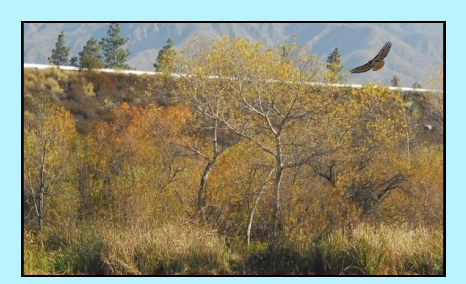
Deciduous trees in fall changing colors.