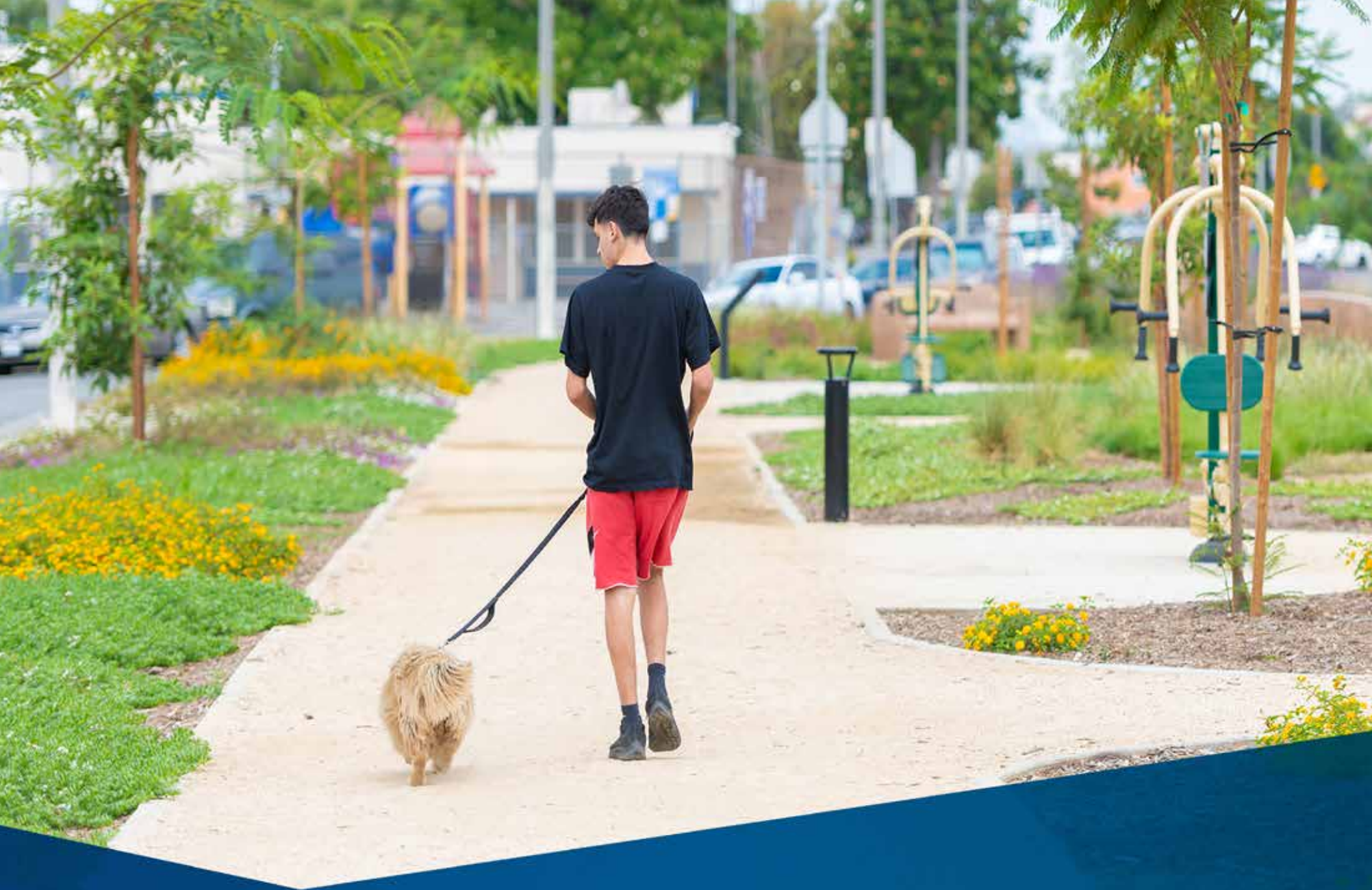
East Los Angeles Sustainable Median Stormwater Capture Project