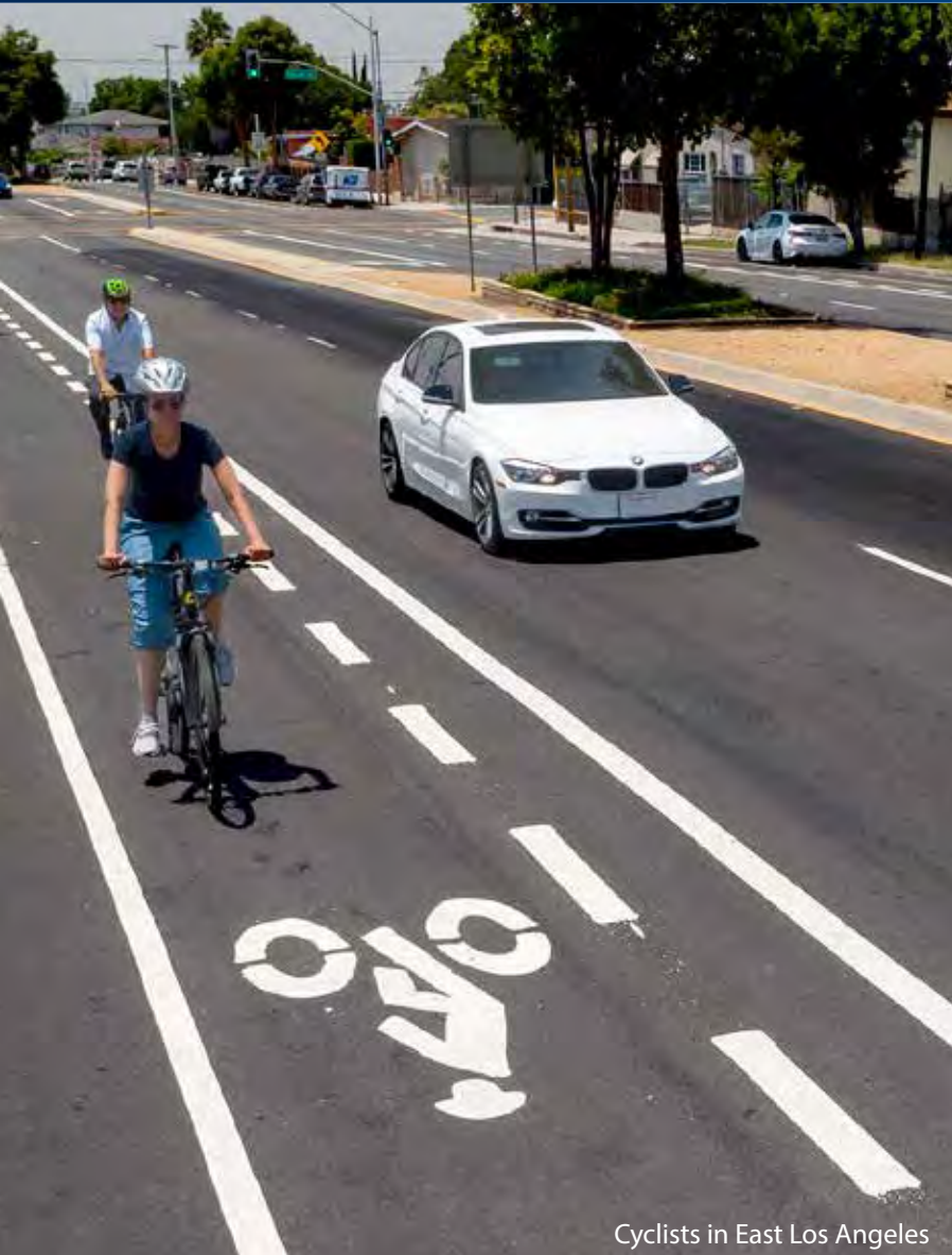
Cyclists in East Los Angeles

The Transportation CSA manages and maintains a vast network of roads, sidewalks, bridges, bicycle facilities, airports, and other transportation infrastructure in the unincorporated areas of the County as well as contract cities; and manages various programs and services to enhance safety and minimize traffic congestion. The Transportation CSA Business Plan establishes various strategies to improve community wellbeing and livability and to expand Countywide mobility and opportunities for alternate transportation choices.