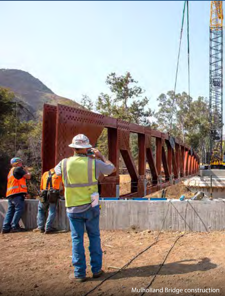
Mulholland Bridge construction

The Construction Management CSA provides program/project management services for the County's Capital Projects Program and Public Works' annual Infrastructure Program. This includes the renovation of existing buildings and the master planning, programming, and construction for new urban infrastructure and buildings for multiple County departments. The Construction Management CSA Business Plan establishes various strategies to deliver sustainable infrastructure and buildings that enable the County to provide goods and services to communities and County residents allowing them to thrive.