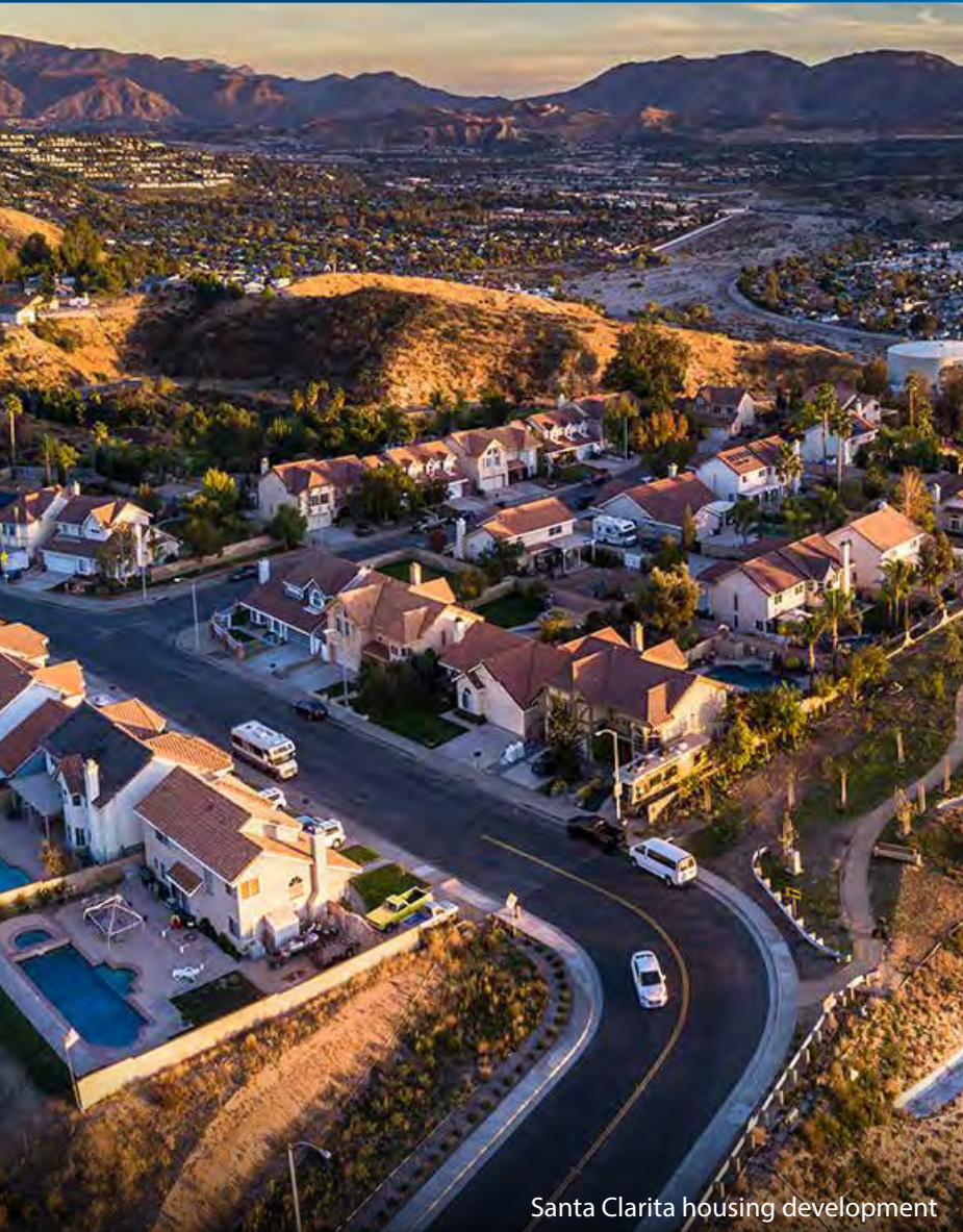
Santa Clarita housing development

The Municipal Services CSA is responsible for the development of safe, sustainable, and resilient communities. Services provided include efficient project entitlement, permitting, and inspection of residential, industrial, and commercial developments. Municipal Services CSA also enhances housing and community development by advancing affordable housing for low-income communities and persons experiencing homelessness. Additionally, Municipal Services CSA safeguards Los Angeles County communities by preparing for and responding to daily incidents; supporting County emergency operations during major emergencies and disasters; and collaborating with first responders, such as Sheriff, Fire, and Office of Emergency Management, to provide outreach on emergency preparedness and community resiliency. Municipal Services CSA strives to improve the management of disaster risks from both natural and human-caused hazards, to enable timely response, safe recovery, and to restore normalcy to communities.