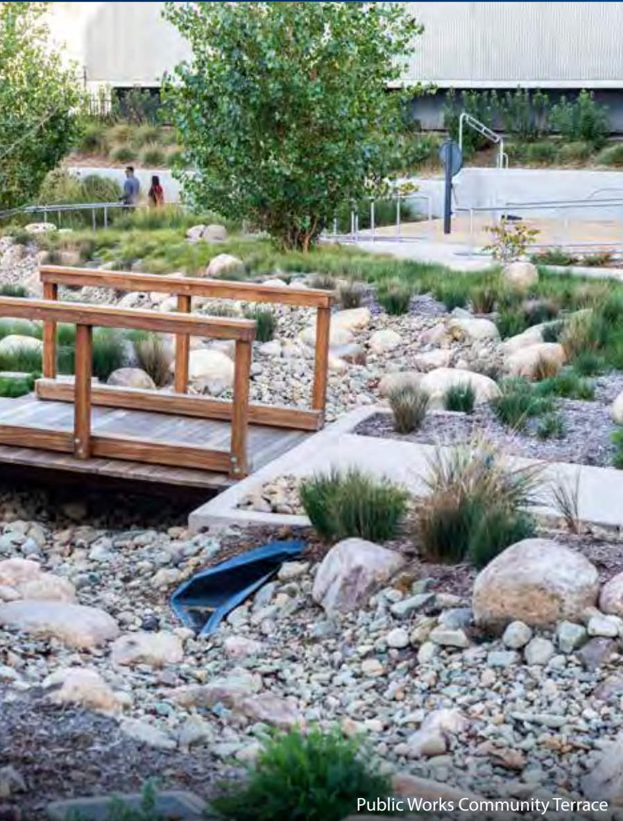
Public Works Community Terrace

Public Contracting and Asset Management (PCAM) provides highly skilled technical services to Public Works' Business Areas through modern infrastructure design, equitable contracting opportunities, and efficient asset management.