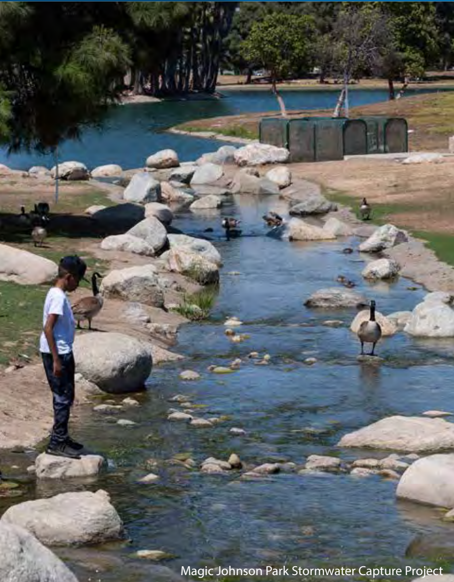
Magic Johnson Park Stormwater Capture Project

The Water Resources Core Service Area (CSA) is responsible for managing stormwater, providing potable water, and ensuring healthy watersheds for the safety and benefit of Los Angeles County communities. It plans, operates, and maintains infrastructure within the Los Angeles County Flood Control and Waterworks Districts through implementation of integrated water resource strategies. The Water Resources CSA Business Plan establishes various strategies to advance regional water resources management practices through the development of enhanced infrastructure, livable communities, and resilient and sustainable resources.