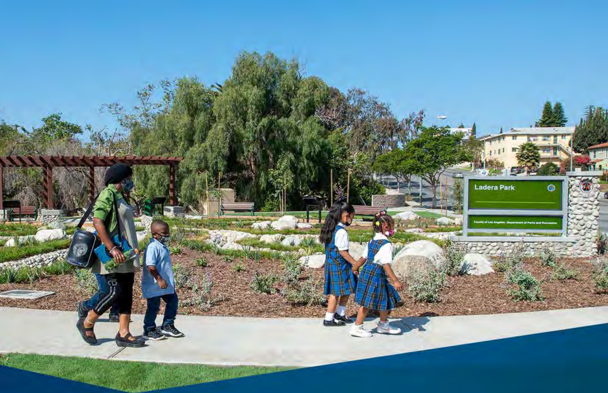
Ladera Park Stormwater Capture Project