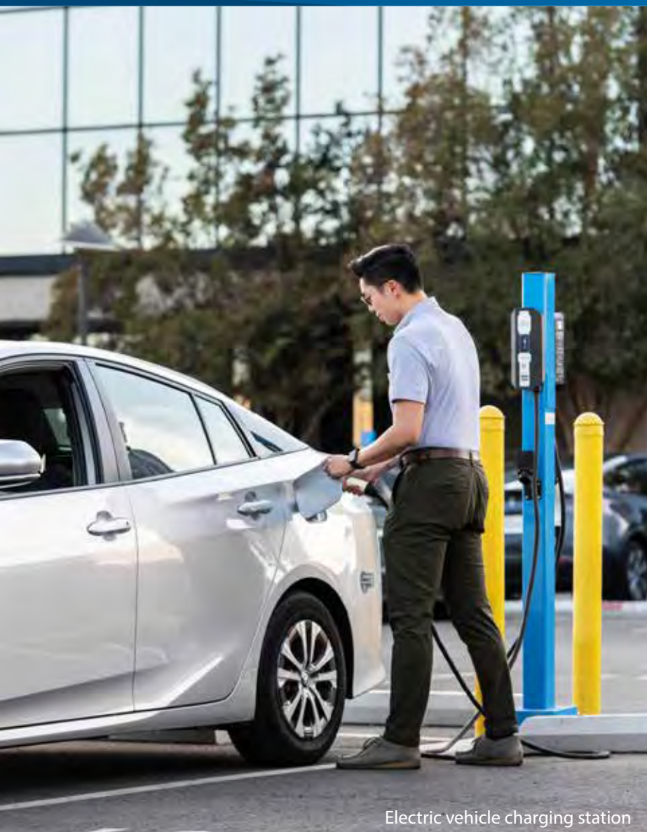
Electric vehicle charging station

The Environmental Services CSA provides solid waste management services, sewer maintenance, and environmental services to our unincorporated communities, contract cities, and the Los Angeles County region. The Environmental Services CSA also supports Public Works' workforce by maintaining a sustainable fleet, protecting employees' health and safety, and reducing risk where possible. The Environmental Services CSA manages solid waste infrastructure consisting of residential waste collection franchises, garbage disposal districts, and a commercial franchise system; manages, operates, and maintains sewer infrastructure within the Consolidated Sewer Maintenance District and the Marina Sewer Maintenance District comprised of sewer lines, sewage pumps, and wastewater control treatment plants; and is also responsible for Public Works' fleet, which includes on- and off-road vehicles and equipment. The Environmental Services CSA Business Plan establishes various strategies centered around equity, resiliency, and sustainability to pursue a waste-free future, optimized sewer infrastructure, and a carbon neutral fleet that will improve the environmental wellbeing of our communities.